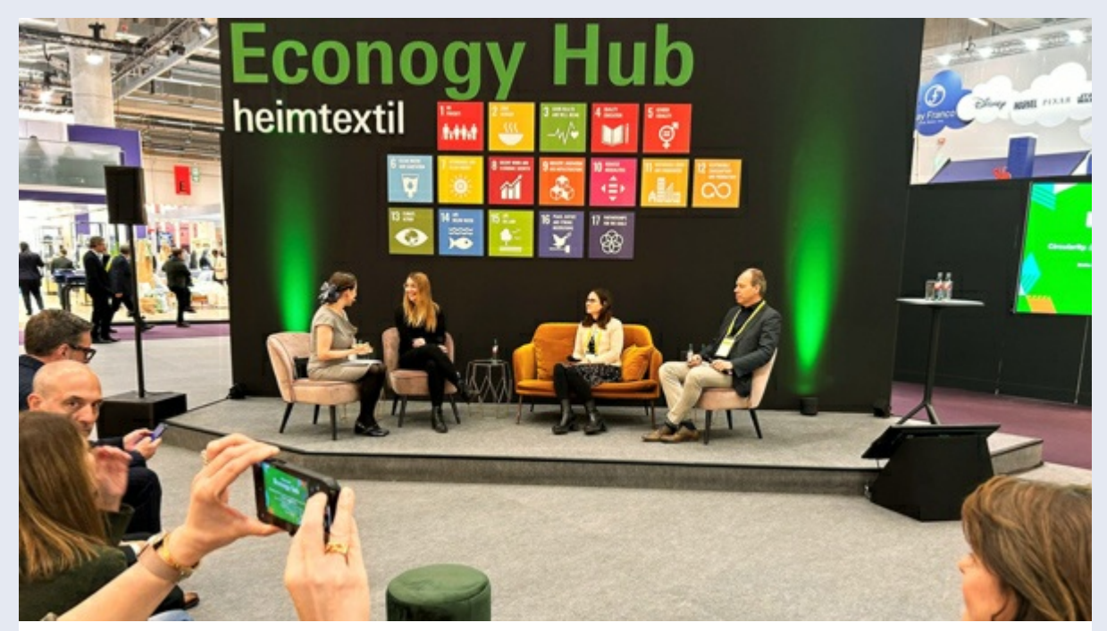
At Heimtextil, the Blue Angel informed visitors and manufacturers about environmental aspects within textile manufacturing.