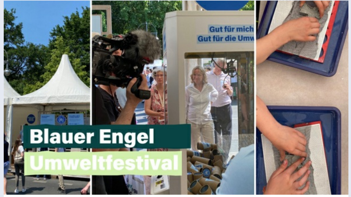
Visit by Steffi Lemke (Federal Ministry for the Environment) at the Environmental Festival in Berlin