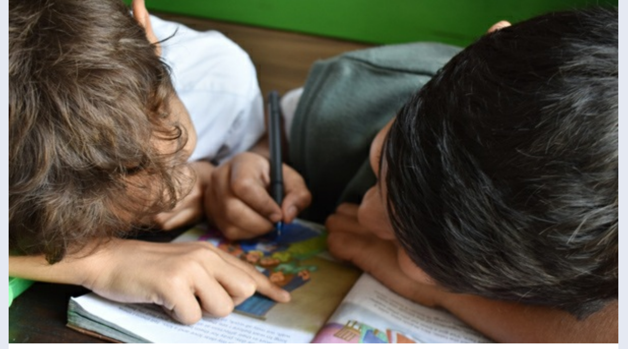
Learning materials are available environmentally friendly with the Blue Angel.